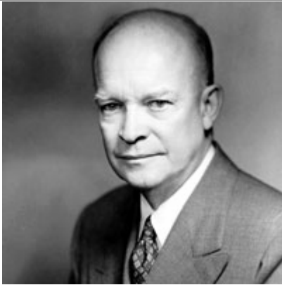
Dwight David Eisenhower 34 th . President, Republican, Term Of Office: January 20, 1953 to January 20, 1961

If I recall correctly, 1958 is the first year that Congress , not President Eisenhower, voted to remove funds from Social Security and put it into the General Fund for Congress to spend . If I recall correctly, it was a democratically controlled Congress . From what I understand, Congress logic at that time was that there was so much money in Social Security Fund that it would never run out / be used up for the purpose it was intended / set aside for.