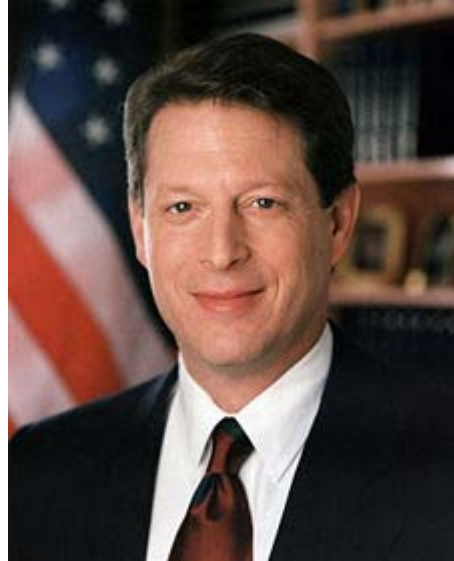
Albert Arnold Gore, Jr. (Al Gore) 45 th . Vice President

Democrat Term of Office: January 20, 1993 to January 20, 2001