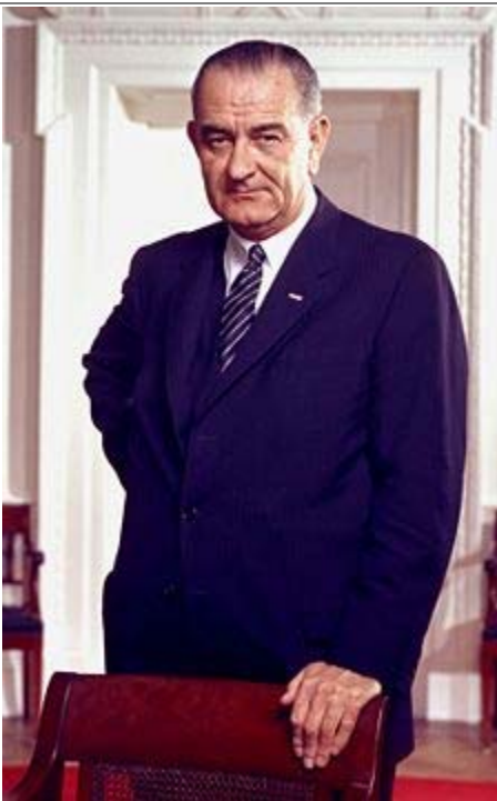
Lyndon Baines Johnson 36 th . President, Democrat Term Of Office: November 22, 1963 to January 20, 1969

Question: Which Political Party took Social Security from the Independent 'Trust Fund' and put it into the General Fund so that Congress could spend it ?