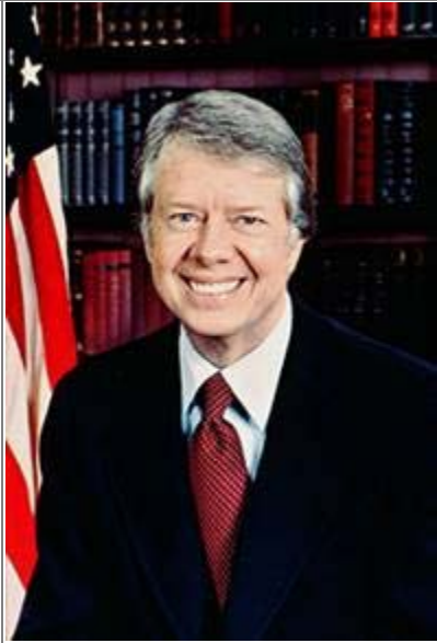
James Earl Carter, Jr ( Jimmy Carter ) 39 th President, Democrat Term of Office: January 20, 1977 to January 20, 1981

Question: Which Political Party decided to start giving Annuity payments to immigrants?