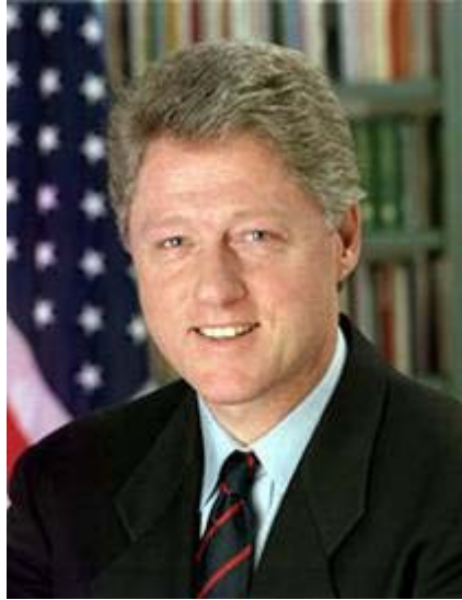
William Jefferson Clinton (Bill Clinton) 42 nd . President

Democrat Term of Office: January 20, 1993 to January 20, 2001